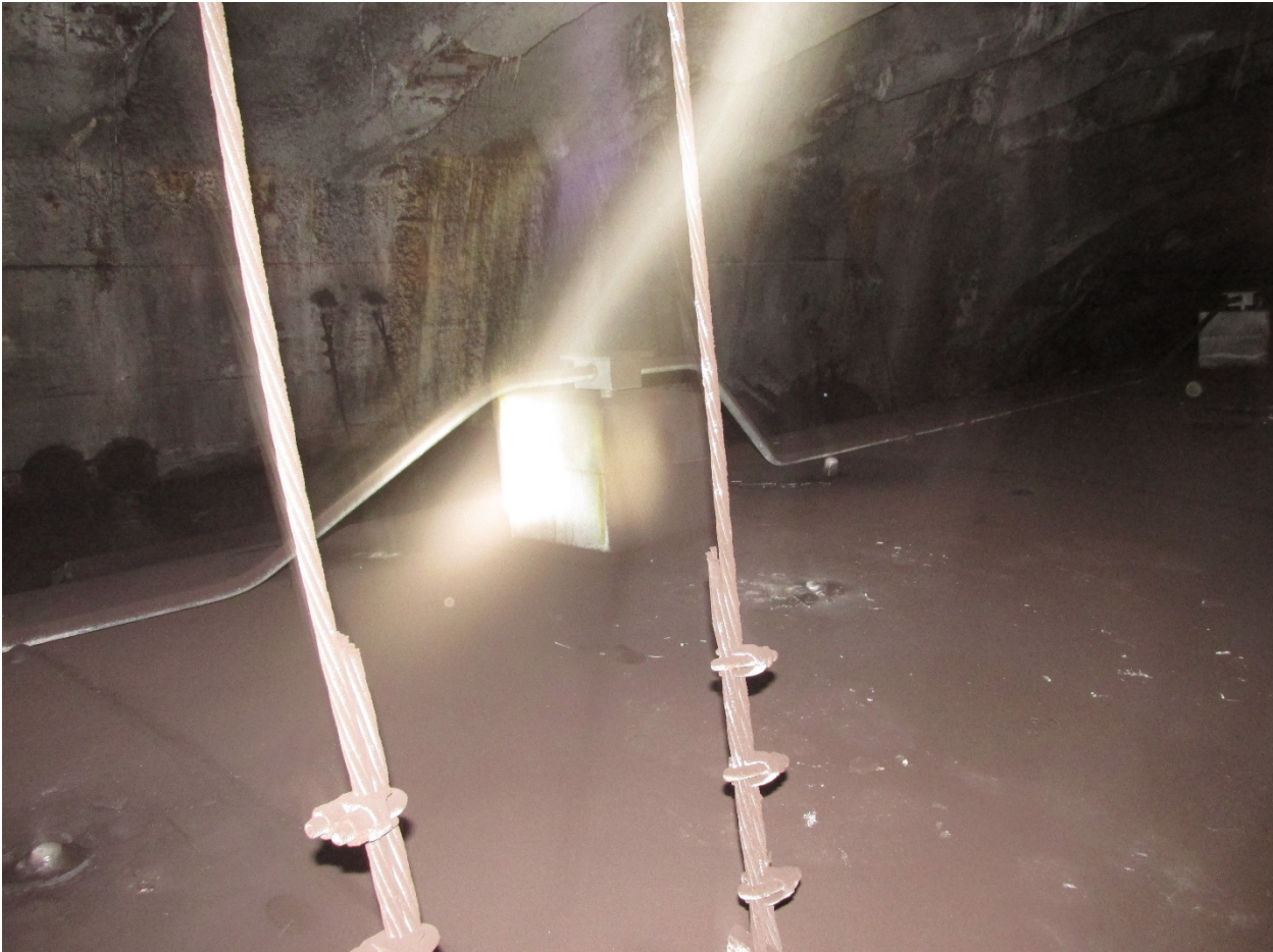
Vault above station arch at south end