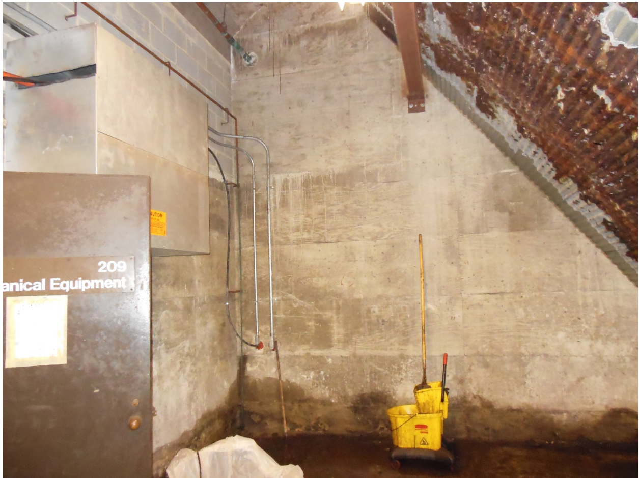
A09 Mezzanine Level South Mechanical Area South Wall