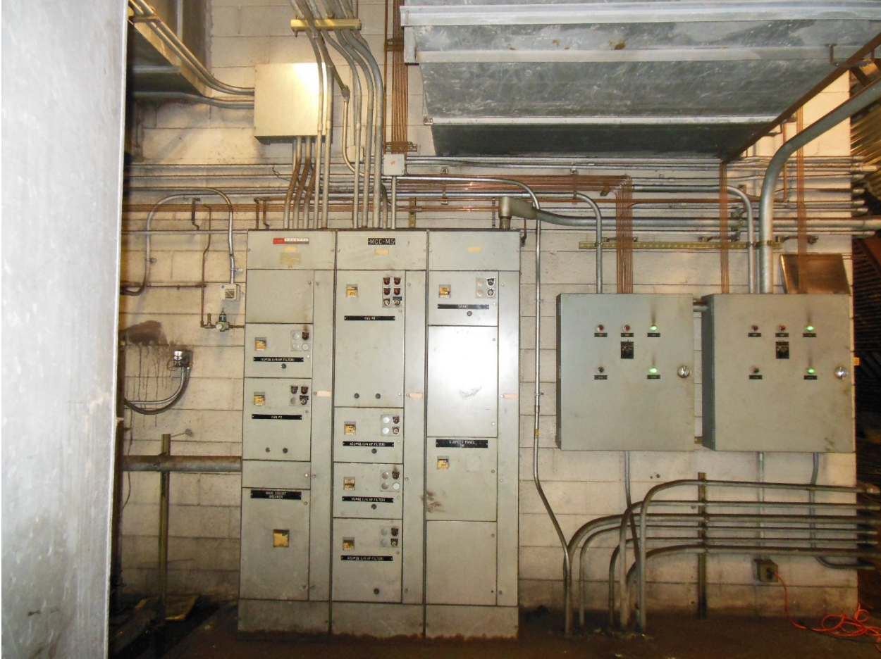
A09 Mezzanine Level South Mechanical Area South Wall