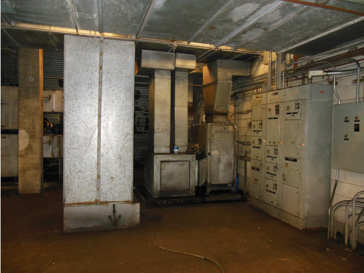
A09 Mezzanine Level South Mechanical Area East Wall