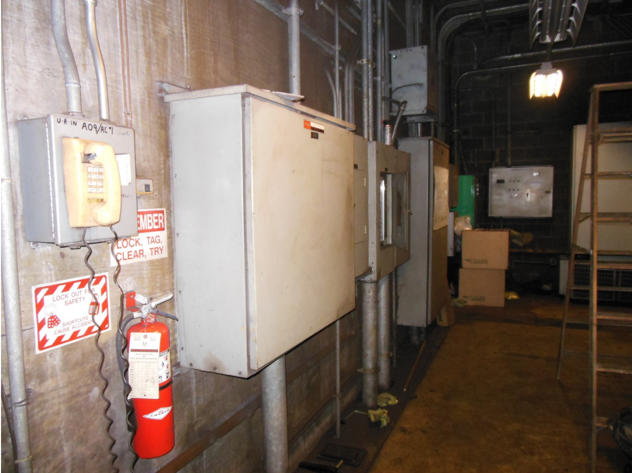
A09 South AC Room West Wall