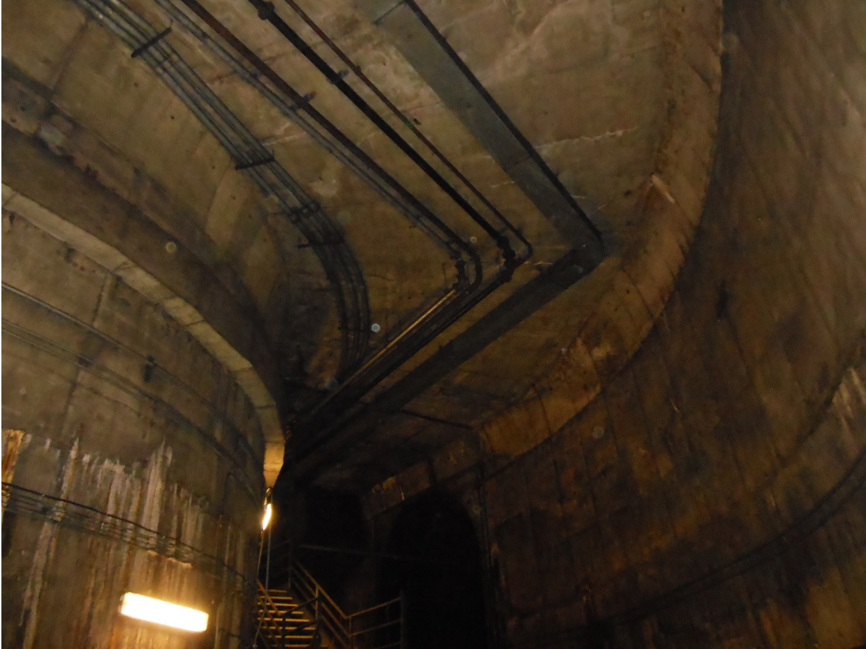
A09 South Vent Shaft Ceiling Looking towards IB track