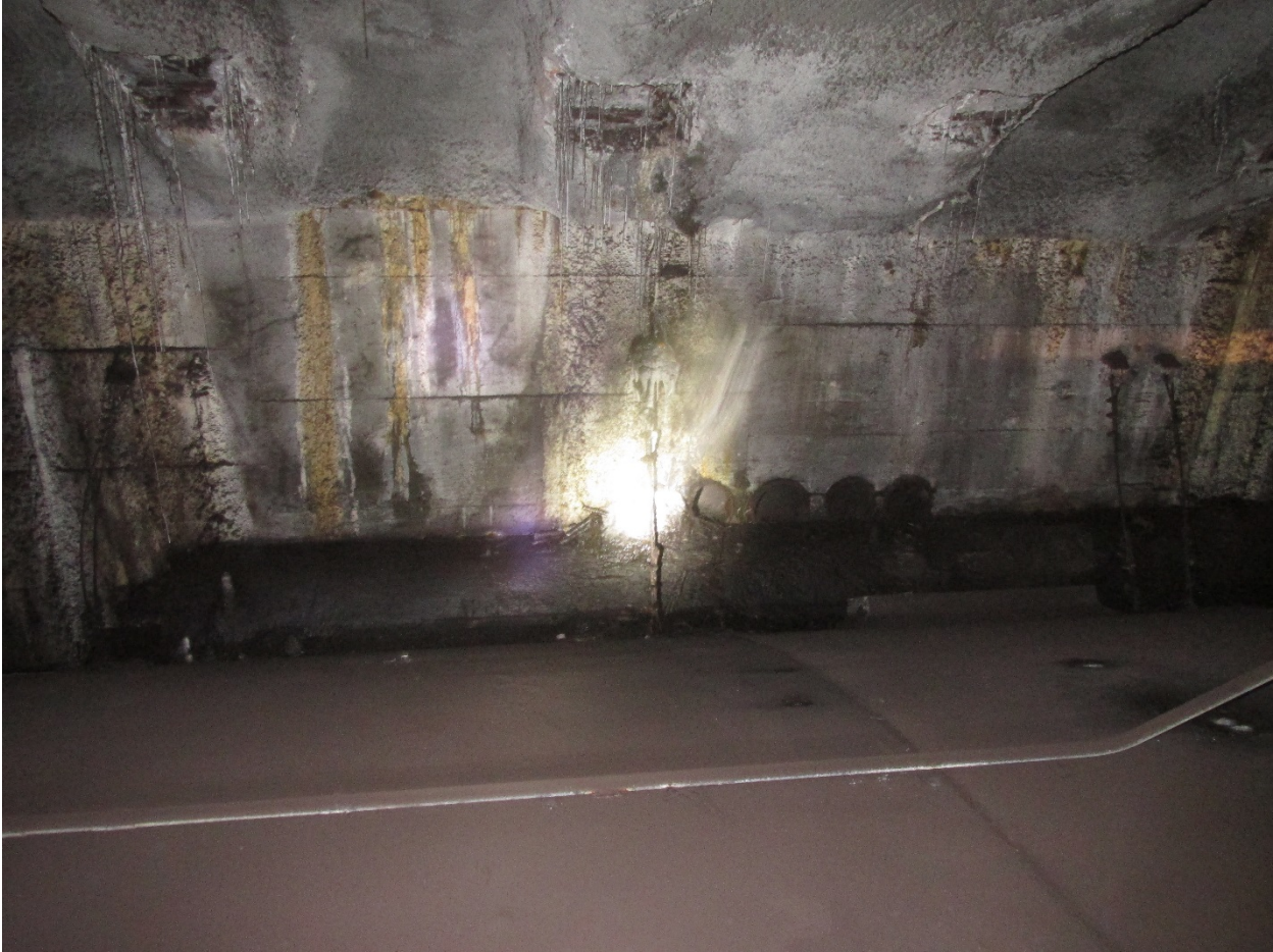
Vault above station arch at south end