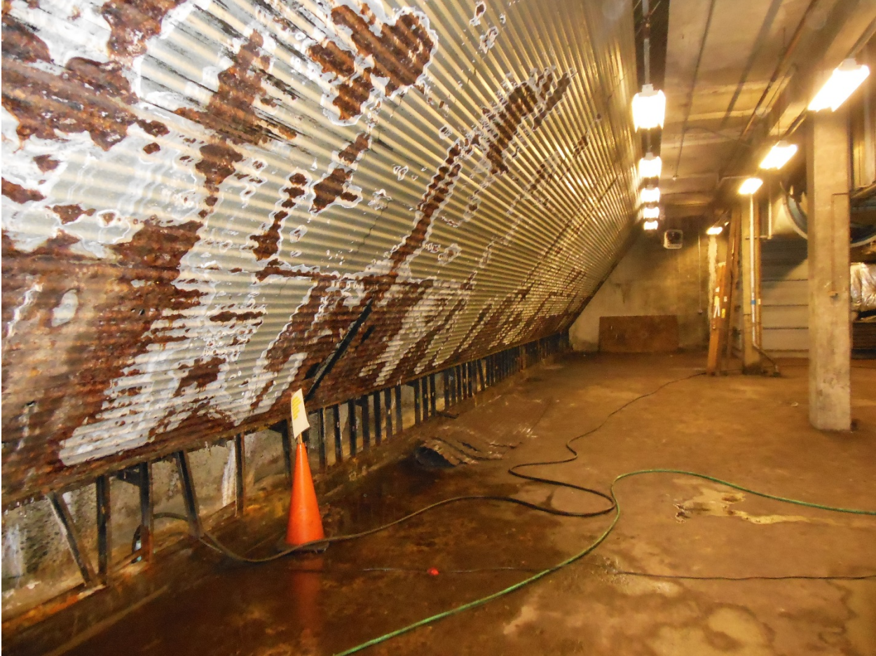
A09 Mezzanine Level South Mechanical Area West Wall