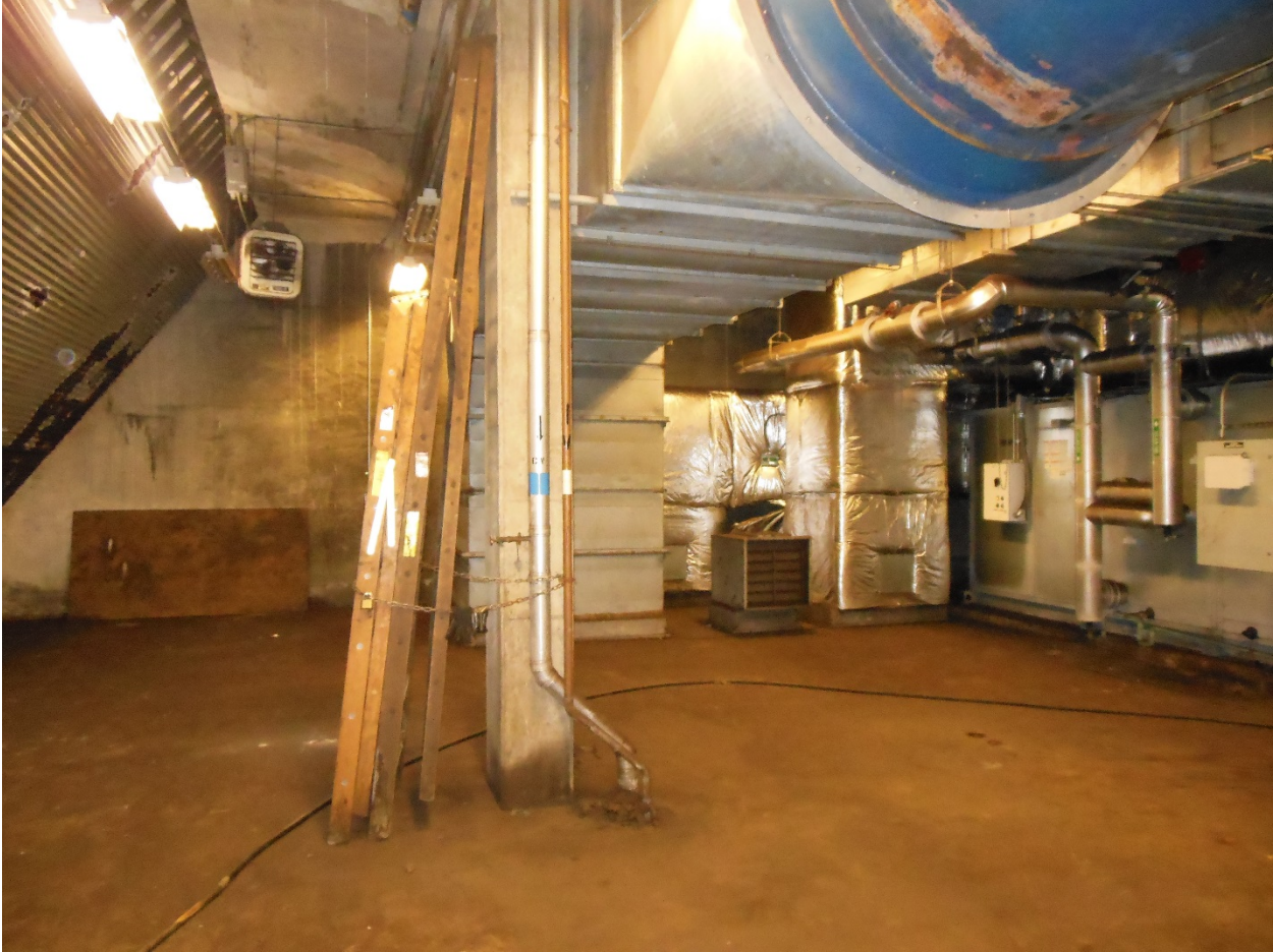
A09 Mezzanine Level South Mechanical Area North Wall