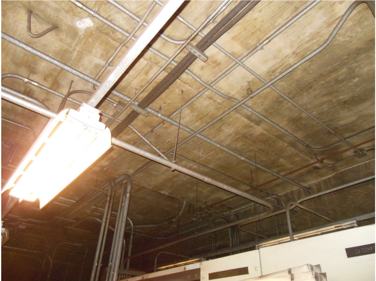
A09 South AC Room Ceiling facing North