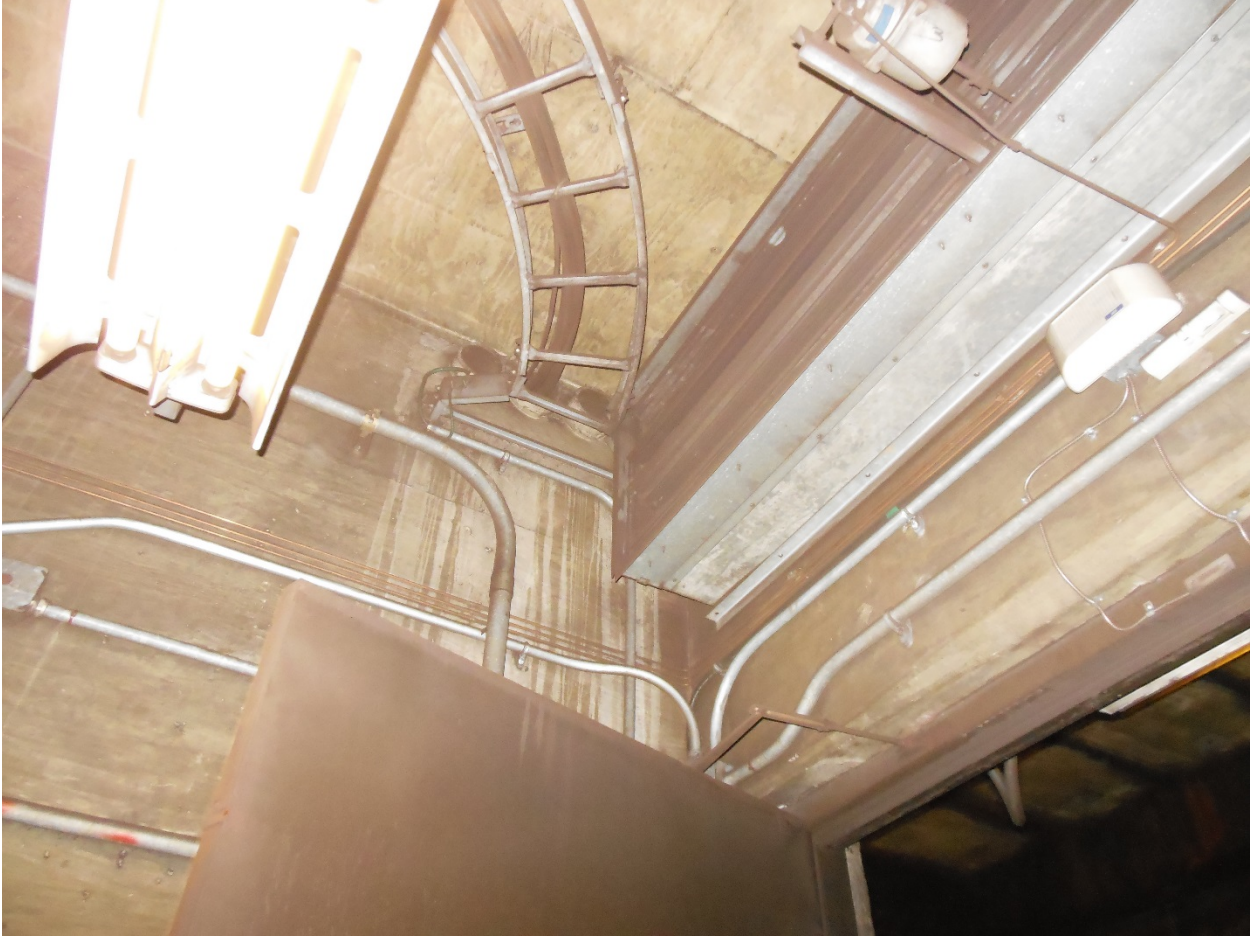
A09 South AC Room South Wall