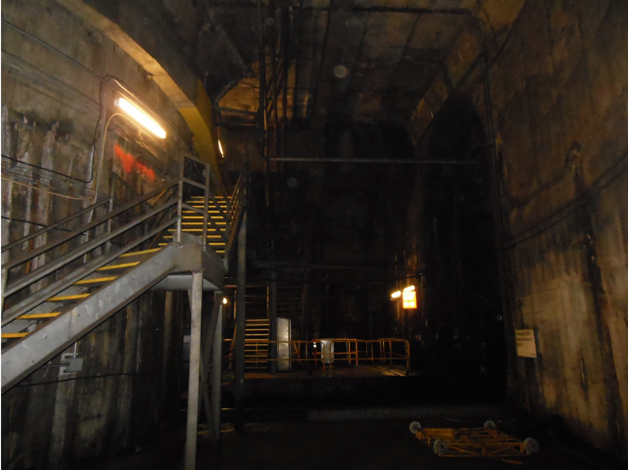
A09 South Vent Shaft Looking towards IB track