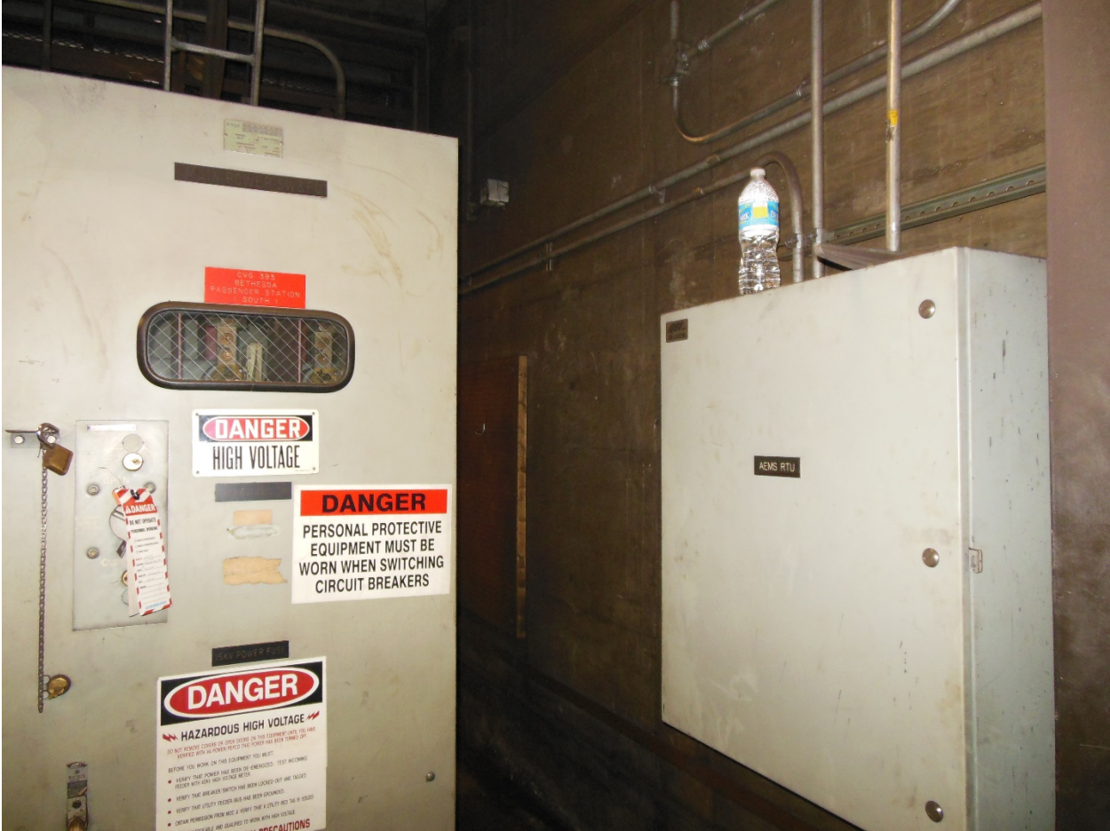
A09 South AC Room South Wall