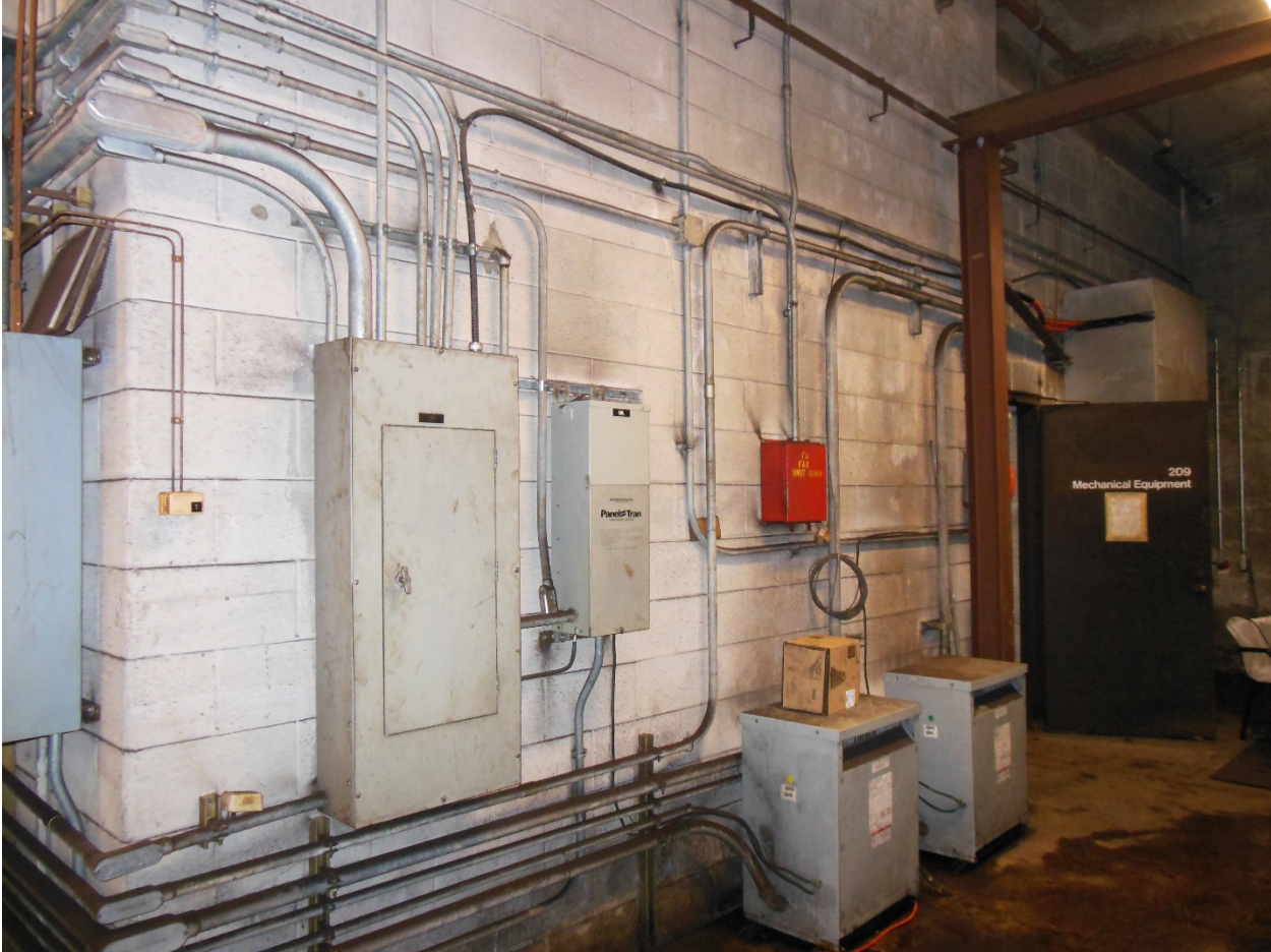
A09 Mezzanine Level South Mechanical Area East Wall at Doorway