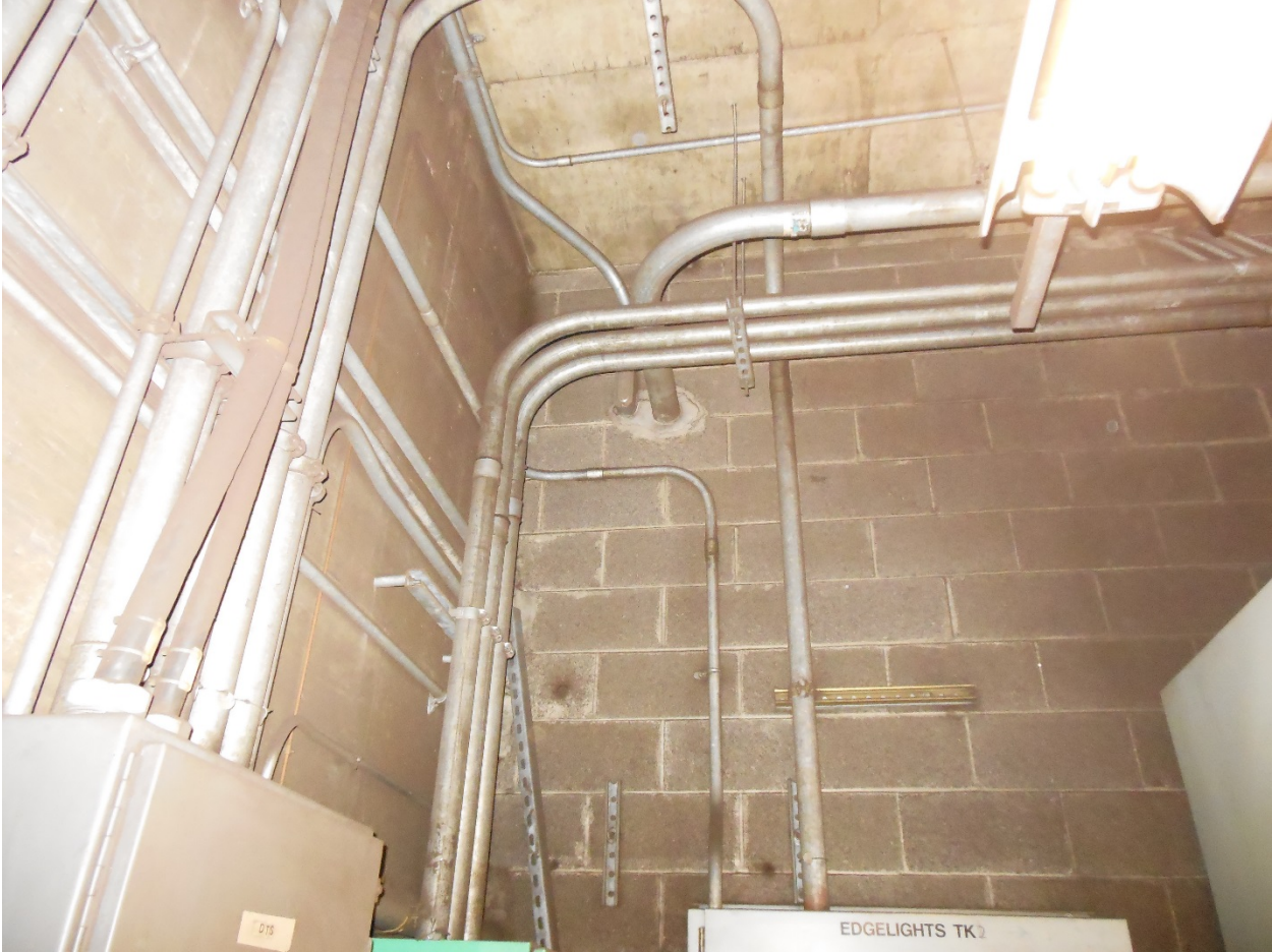
A09 South AC Room North West Corner