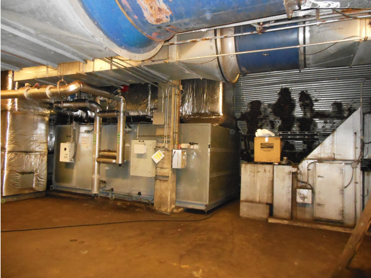
A09 Mezzanine Level South Mechanical Area East Wall