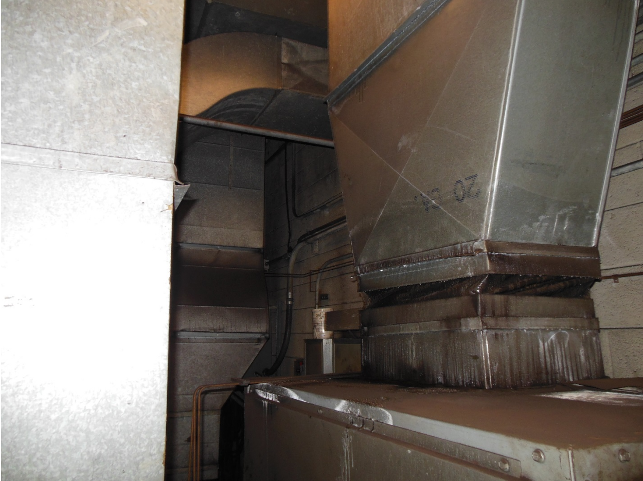
A09 Mezzanine Level South Mechanical Area South Wall