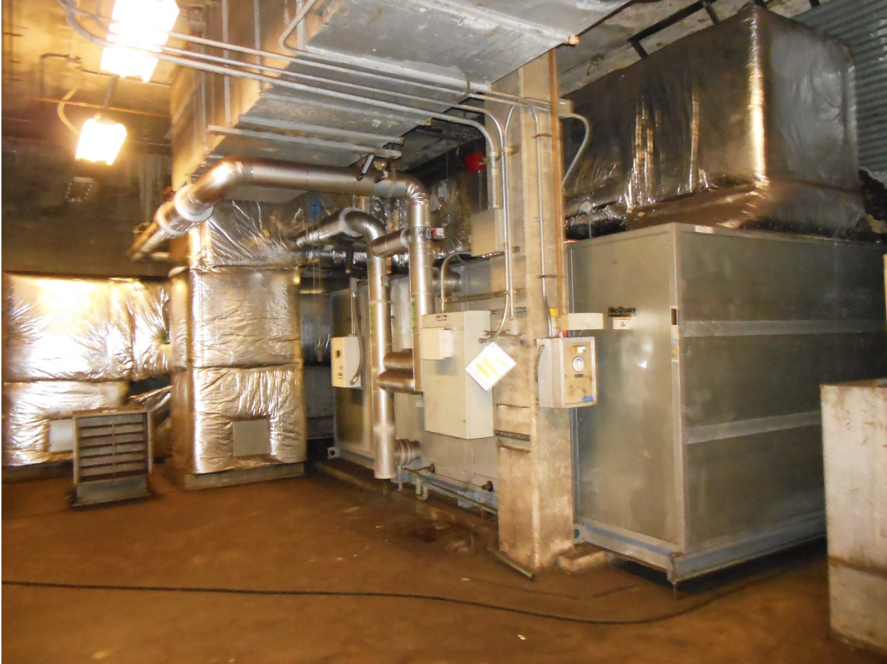
A09 Mezzanine Level South Mechanical Area North Wall