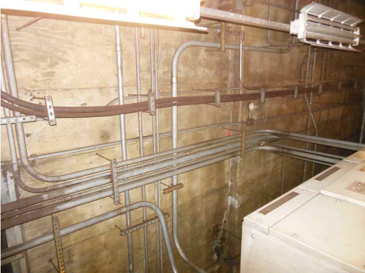
A09 South AC Room Ceiling Facing South