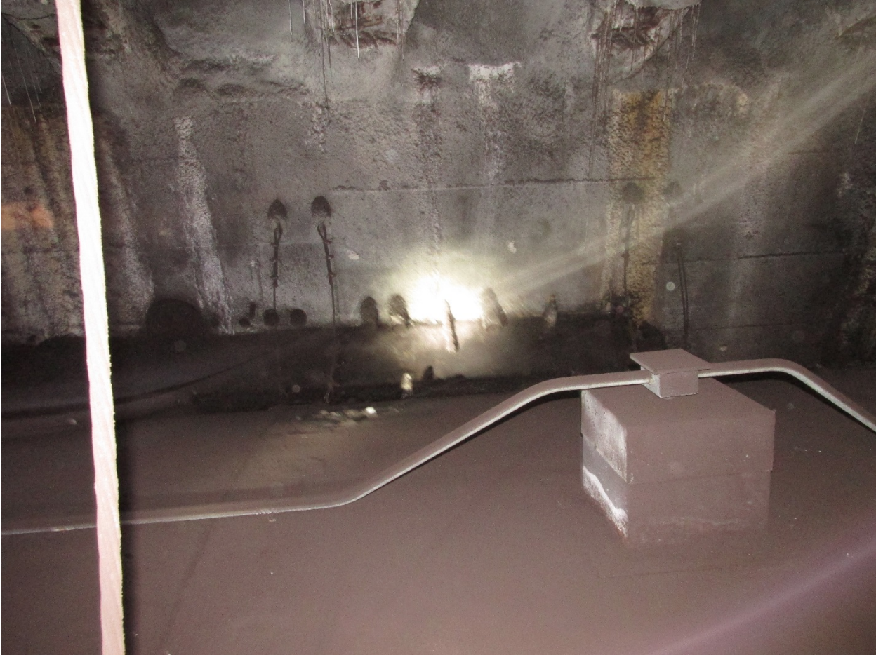
Vault above station arch at south end