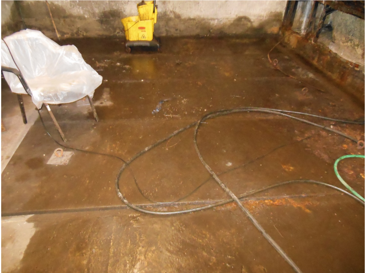
A09 Mezzanine Level South Mechanical Area Removable Floor Panels