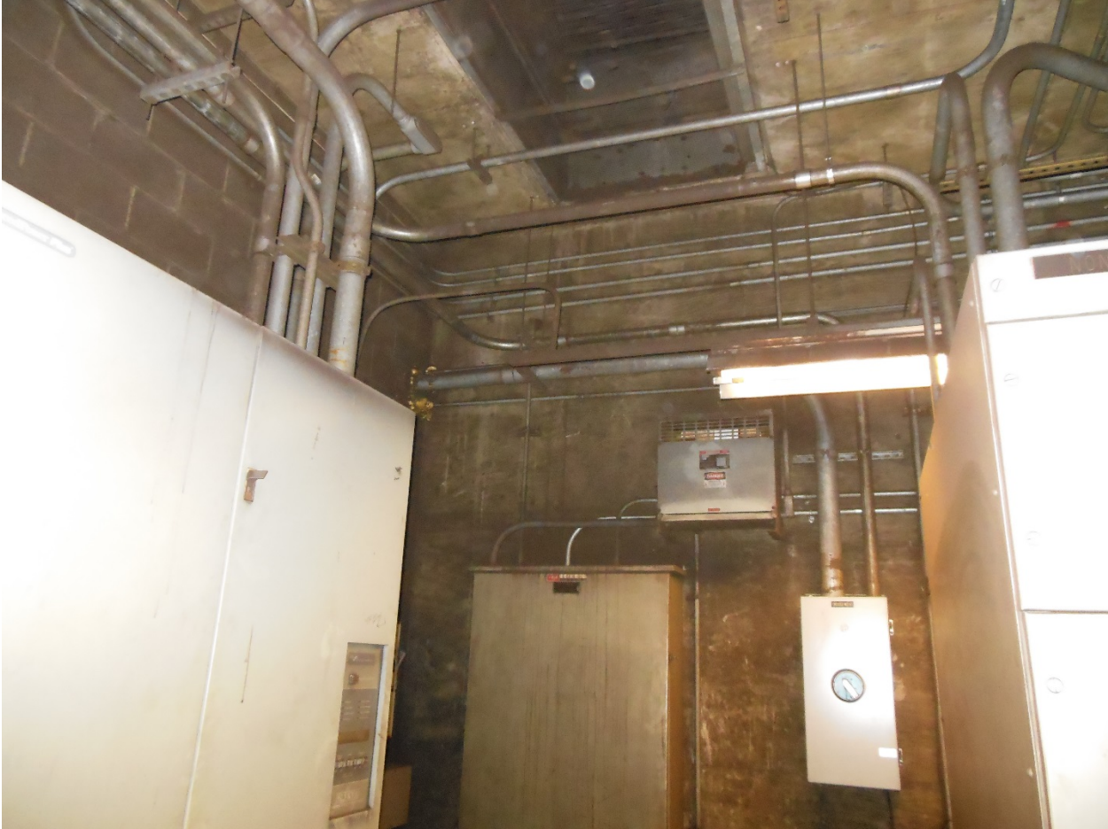
A09 South AC Room North East Corner