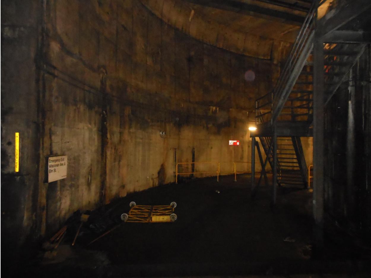
A09 South Vent Shaft Looking from ~Platform Center line