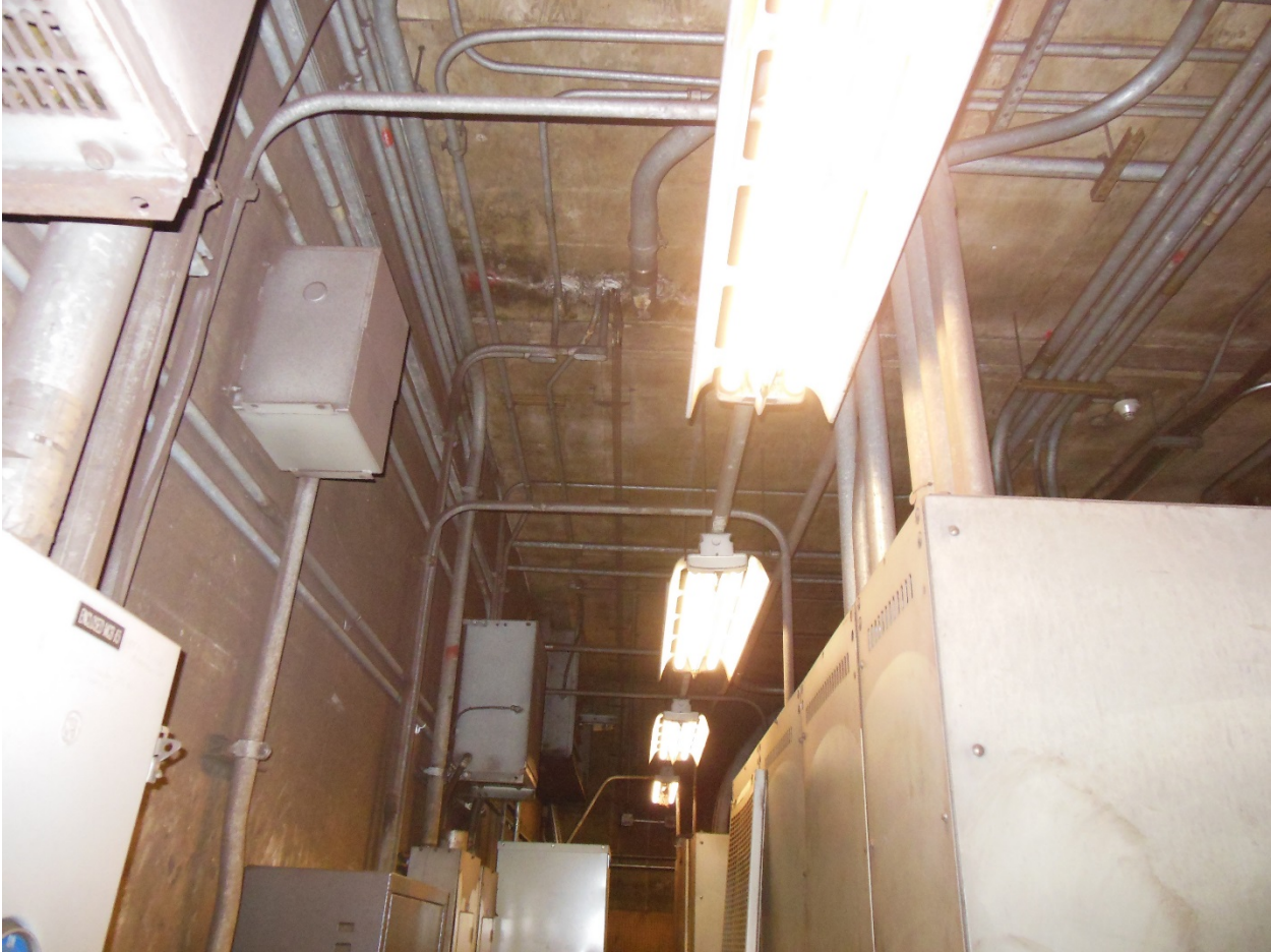
A09 South AC Room East Wall