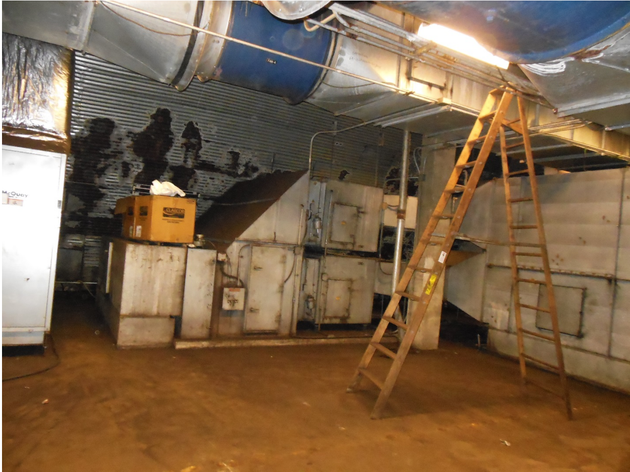
A09 Mezzanine Level South Mechanical Area East Wall