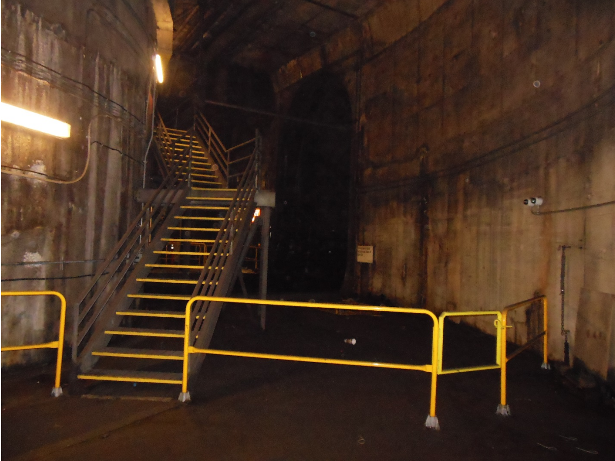
A09 South Vent Shaft Looking towards IB track