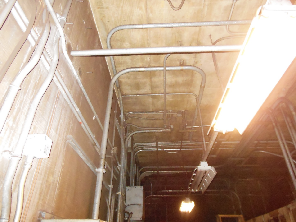
A09 South AC Room West Wall Ceiling