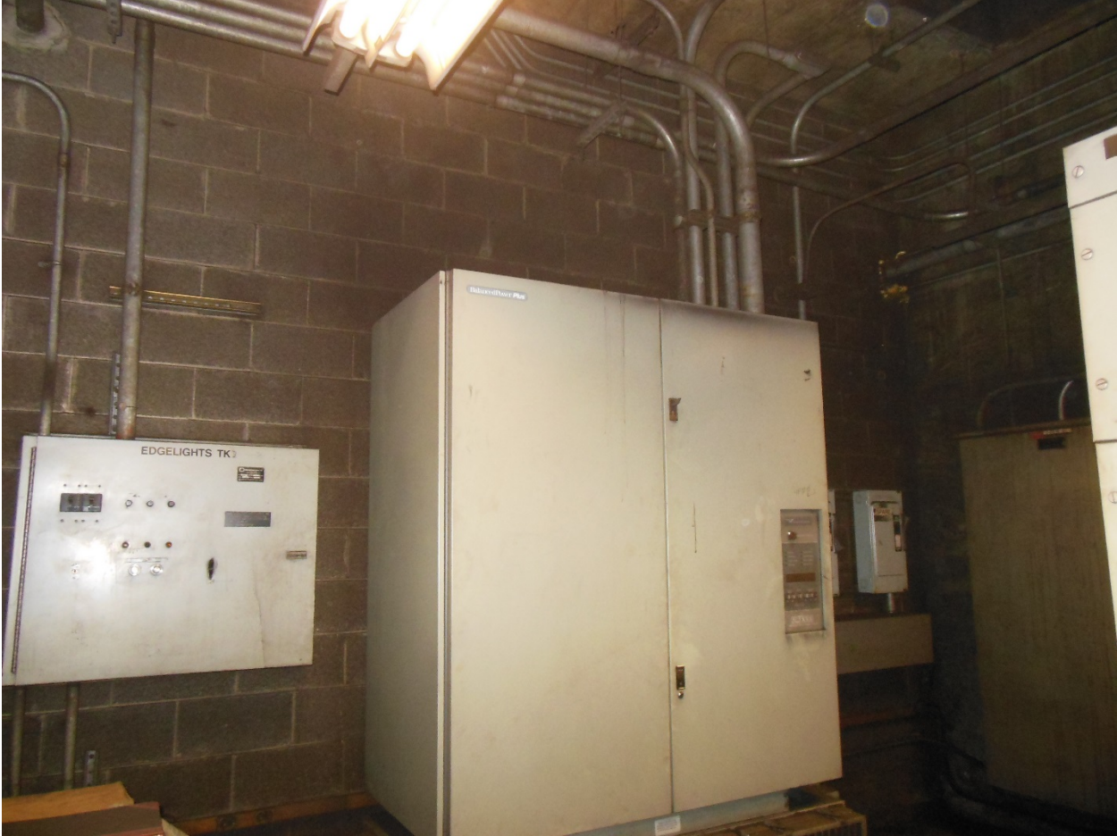
A09 South AC Room North Wall