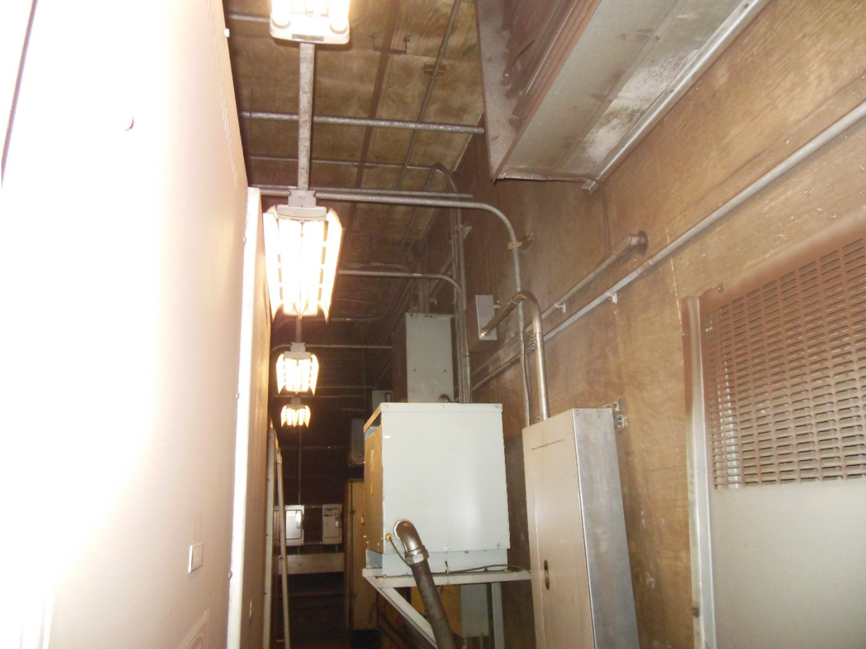
A09 South AC Room East Wall